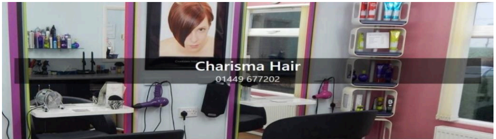
Charisma Hair 01449 677202

86a Forest Road, Onehouse charismahair.co.uk / 01449 677202