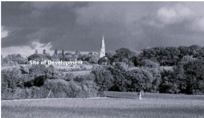
Photo below depicting site of proposed development

In addition to the meeting organised by Finborough School, there will be an opportunity to attend the Parish Council meeting when the application is discussed, expected to be at their meeting on 11 March.